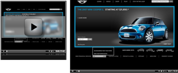
TechSmith ExpressShow (Mini Cooper is a mark owned by BMW AG)

“This is one that pleases the experts and the newcomers alike. There is simply no other screen capture and production tool in the same class. If you need to accurately capture what is displayed on your screen and then easily present it to a target audience in a professional manner then Camtasia Studio is the only choice. It always leaves my users wondering how I did it.”