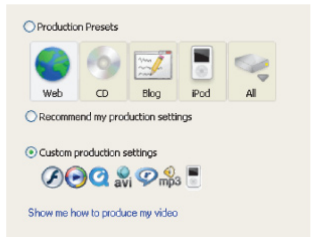
Production options in Camtasia Studio